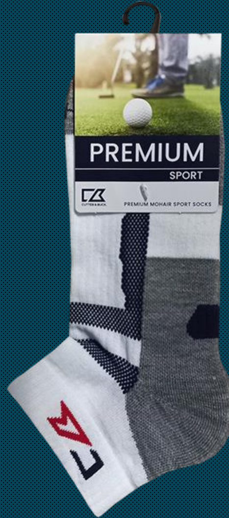
CB Anklet – Mohair (Sz 4-7 & 8-12)