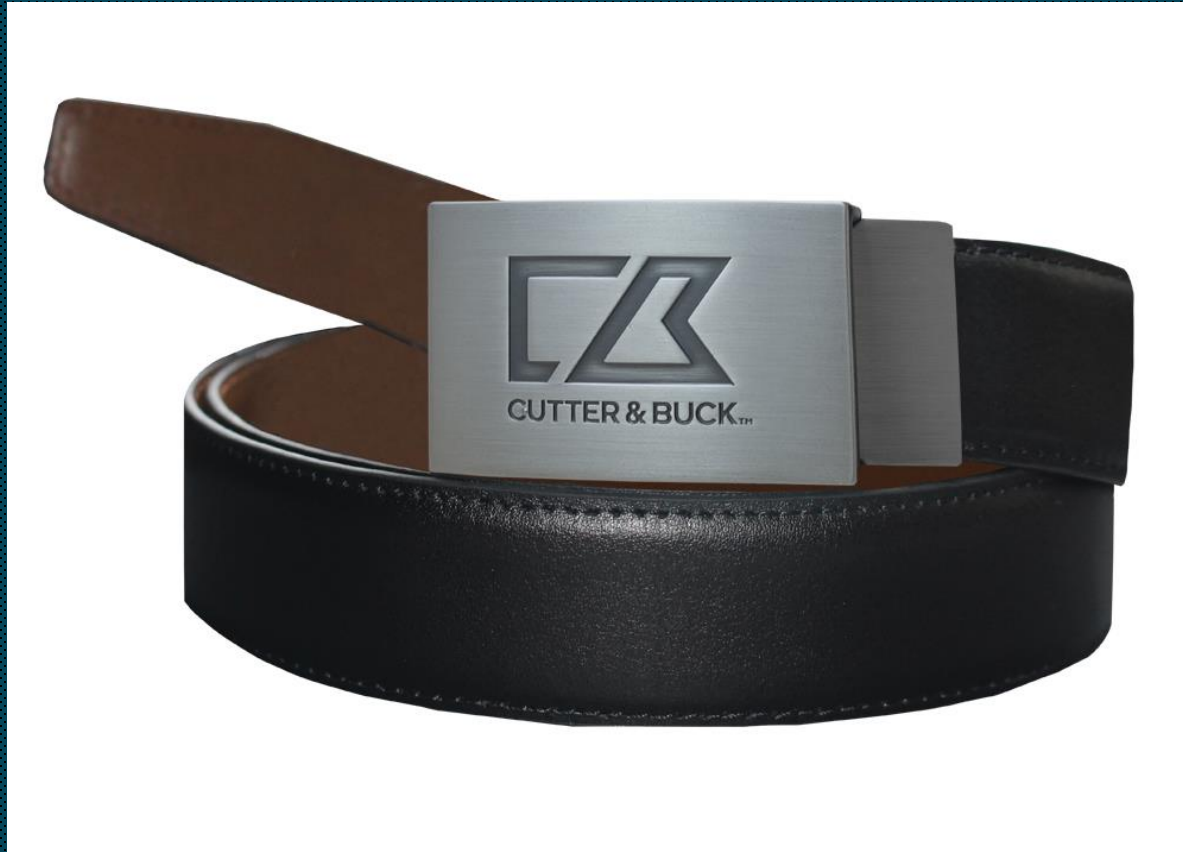
C&B Reversible CTS (Black/Brown) Custom Reversible CTS (Black/Brown)