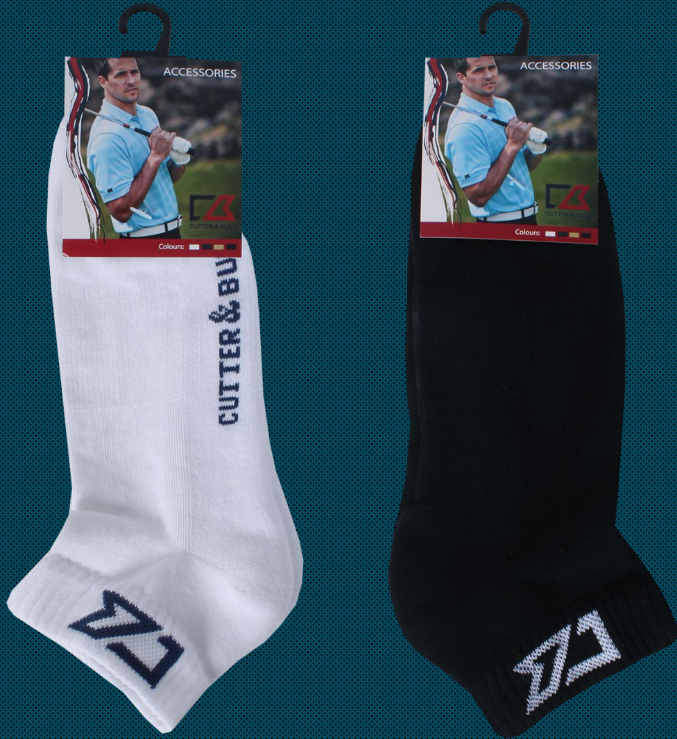
CB Anklet – Cotton (Sz 4-7 & 8-12)