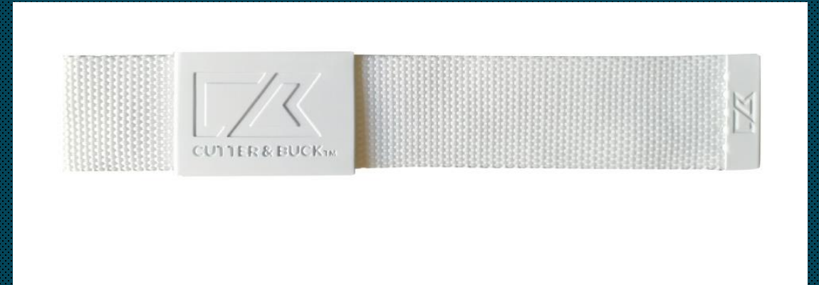
C&B Stretch CTS (Black & White)