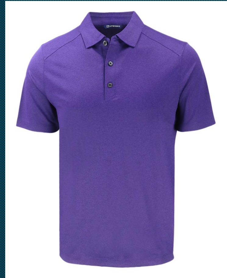
College Purple Heather